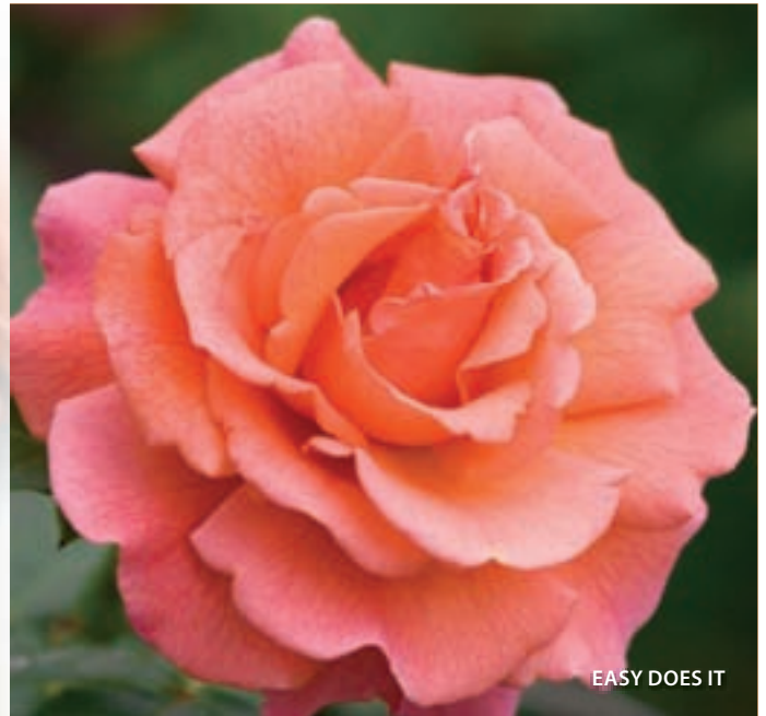
EASY DOES IT