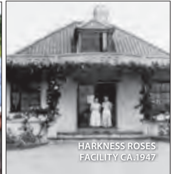
HARKNESS ROSES FACILITY CA.1947