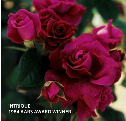
INTRIGUE 1984 AARS AWARD WINNER