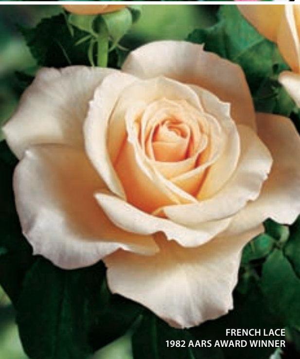
FRENCH LACE 1982 AARS AWARD WINNER