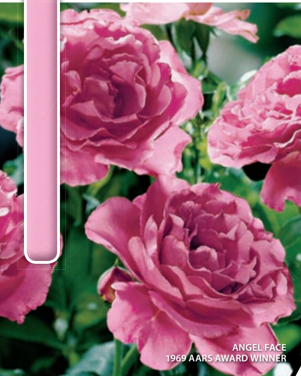
ANGEL FACE 1969 AARS AWARD WINNER

Color .....Deep mauve-lavender Height..... Up to 3' Bloom Size ..... 3½"-4" Stem Length..... Medium Petal Count..... 30-35 Bud Form..... Urn-shaped Foliage.....Dark green Fragrance..... Strong old-rose Parentage . (Circus x Lavender Pinocchio) x Sterling Silver