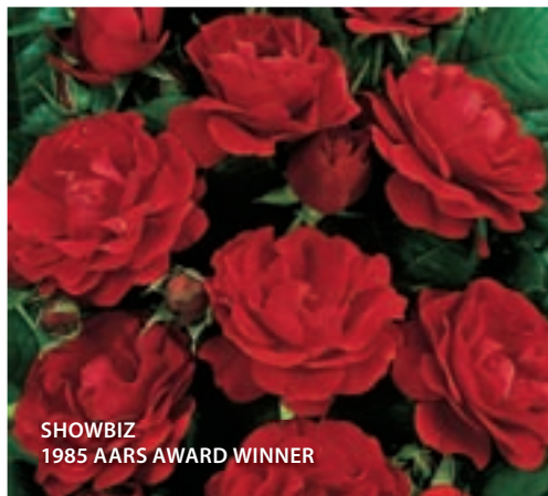
SHOWBIZ 1985 AARS AWARD WINNER