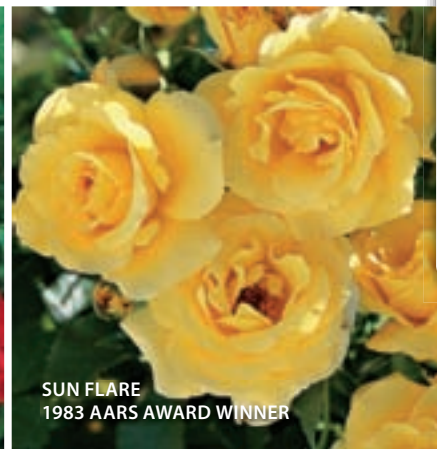
SUN FLARE 1983 AARS AWARD WINNER