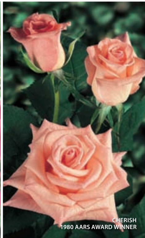
CHERISH 1980 AARS AWARD WINNER

Color .....Shell pink Height..... 4' Bloom Size ..... 4" Stem Length..... 10"-15" Petal Count..... 25 Bud Form..... Perfect, high-pointed Foliage..... Leathery, glossy dark green Fragrance.....Light spicy Parentage .....Bridal Pink x Matador